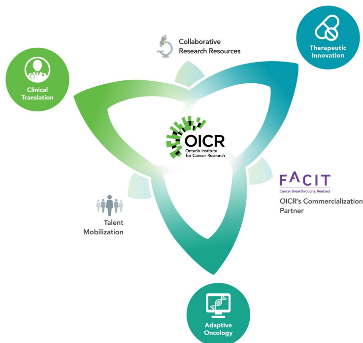
Figure 1: OICR's Research Themes and Enablers